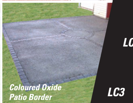
Coloured Oxide Patio Border